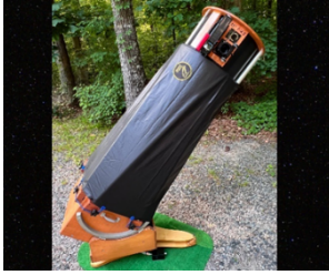
5. Sign CAAC