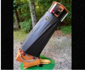
5. Sign CAAC