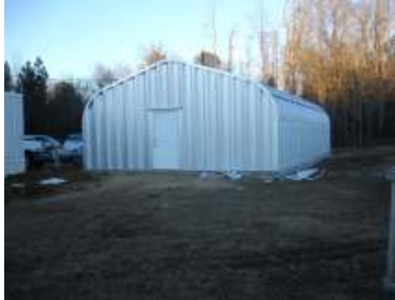
Our new home at the GHRO.

Star Party at GHRO Feb. 5, 2011 weather permitting